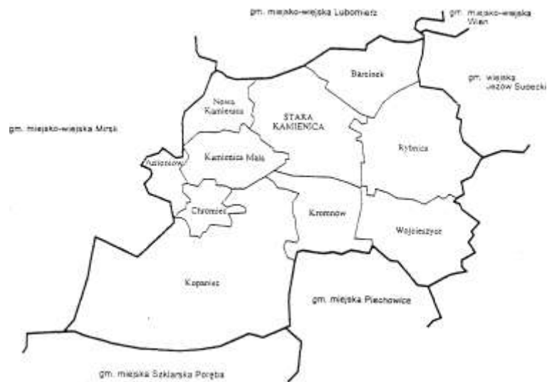
Graph 2. Territorial division of community Stara Kamienica 12

There live 5152 people in the area 11 , more than half of which are women. The positive tendencies in age structure are: quite big amount of people in ‘before productive’ age (1128), also big amount of people in productive age (3371) and positive birth rate.